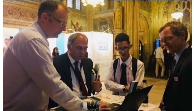
Statisticians from the House of Commons Library and the Office for National Statistics show Bambos Charalambous MP the brand new constituency data dashboards.

Evidence Week ended with a roundtable about what people want and need from evidence gathering, which SAGE will publish as a discussion paper this autumn.