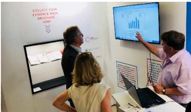
In under 3 minutes, researchers from the Universities of Durham and Northumbria show Peter Dowd MP how to disaggregate data.