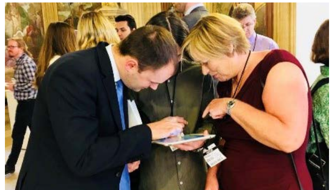
Luke Hall MP looks through air quality data with a constituent.