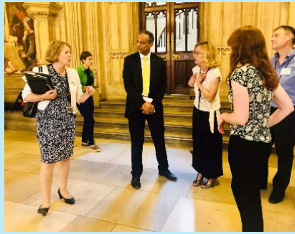
Vicky Ford MP with the Health Research Authority and Royal Pharmaceutical Society.