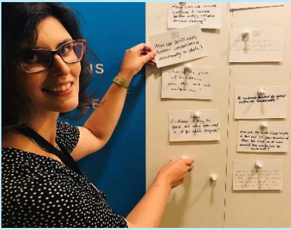
Layla Moran MP brings her questions to the Evidence Week stand.