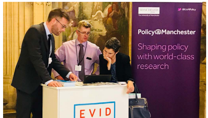
Mary Creagh MP is shocked by London air quality data.